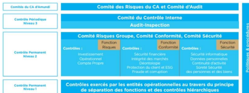
Schéma du dispositif de contrôle interne

The table below details the internal control system implemented by Amundi.